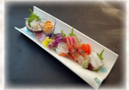
※Take(Bamboo) sashimi 8piece